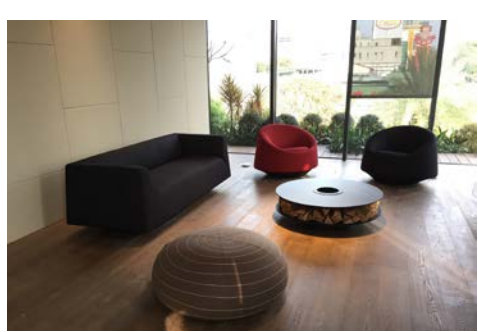
Romulus (Taipei, Taiwan)