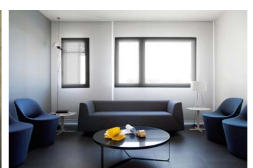
COB (Meda, Italy)