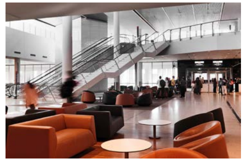
Perth Airport (Perth, Australia)